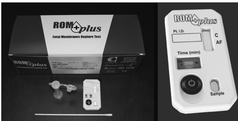
Figure 1 Photograph of the new Immunoassay Test Kit showing the sample window, lateral flow window with labels C (control line), AF (amniotic fluid line), and timer with activation button.