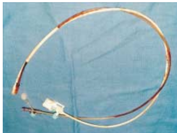
Figure 1 Two bound catheter systems.

The two catheter systems were bound together in a parallel fashion with flexible heat shrink-wrap tubing continuously to 15 cm of their distal tips (Figure 1). This ensured that both catheters were at the same intrauterine location. The catheters were packaged, sealed and sterilized before use. A G.E. Medical Systems monitor (Corometrics, Model 120, Milwaukee, Wisconsin) was used to record the Koala® catheter system, and fetal heart rate (FHR) from a fetal scalp electrode, while a Hewlett Packard monitor (model 8040A, Andover, Massachusetts) was used to record the Intran® Plus Signal. The monitors were precalibrated and zeroed before use. The instructions for use included with each catheter were followed to zero and interface them to their respective monitor and reusable cable.